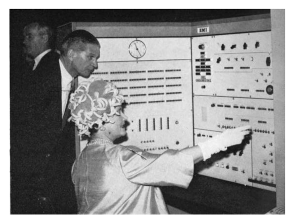
Figure 2. The Queen Mother inaugurates the EMIDEC 2400 at the Newcastle headquarters of the Ministry of Pensions, by pressing a switch that starts a "sort and merge" program. This particular program operated on over 200,000 items and took roughly 50 minutes to complete, according to the Ministry.

One of the most critical elements of this system, available to every Briton of working age, was a National Insurance card. Not only did this card ensure eventual pension benefits, it was also, much like social security cards are in the U.S., essentially required in order for a person to be legally employed. Inaccuracies on the National Insurance card could spell disaster not